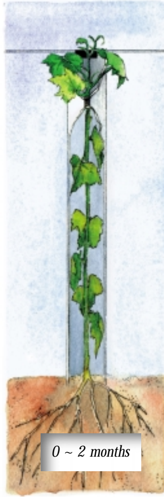
0 ~ 2 months

Planting, Assembly and Installation Install GroGuards at the same time you plant cuttings, dormant or green vines. Cuttings grow well in GroGuards and lag only a few weeks behind rootlings. Zip-Safe® seal makes assembly quick and easy. Your vines are now safe from herbicide, wind, sand blast and grazing animals.