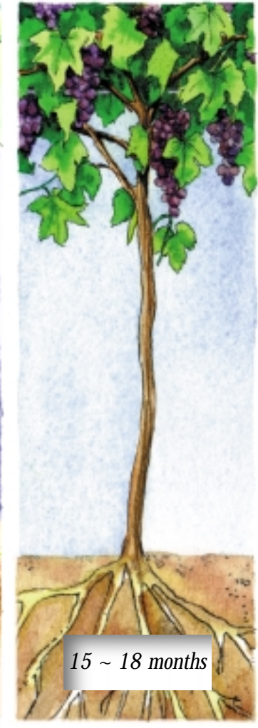
15 ~ 18 months

Removing GroGuards With four fully expanded leaves out the top, GroGuards may be removed to reduce soiling and weathering. Alternatively, leave GroGuards on until winter to maintain herbicide protection. GroGuards can be re-used immediately, stored or easily sold through our free website marketplace at www.groguard.com.au/