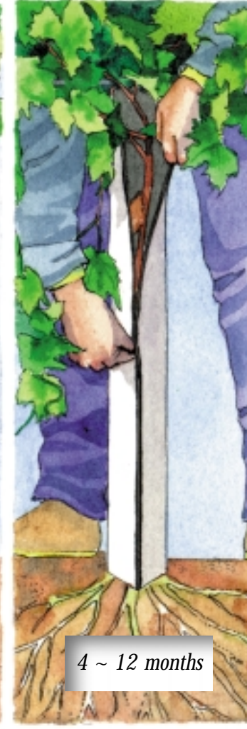
4 ~ 12 months

On the wire. Vines run along the wire after 3-9 weeks. The vine is covered after 3-6 months. Increase irrigation to normal levels as the canopy expands. GroGuards Zip-Safe® herbicide protection means better, cheaper weed control and more growth. Vines started in GroGuards cover the wire faster.